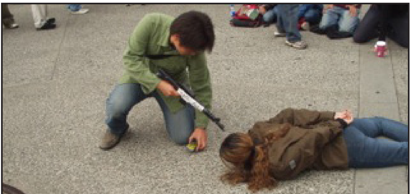
UC Berkeley: an anti-Israel demonstration during Israeli Apartheid Week

What's the solution? Answer BDS' Big Lies with cogent arguments and the historical record. As U.S. Supreme Court Justice Louis D. Brandeis wrote, "Truth is the best disinfectant."