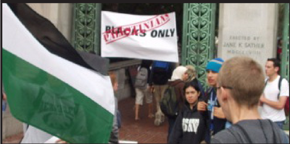
UC Berkeley: an anti-Israel demonstration during Israeli Apartheid Week